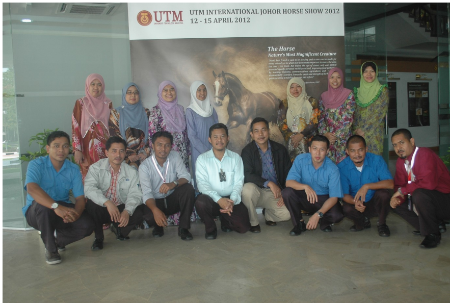
The Horse: Nature's Most Magnificent Creature Exhibits Committee