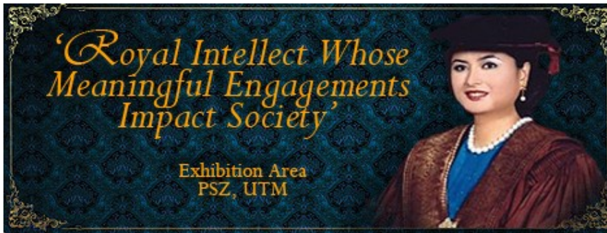
Royal Intellect Whose Meaningful Engagements Impact Society