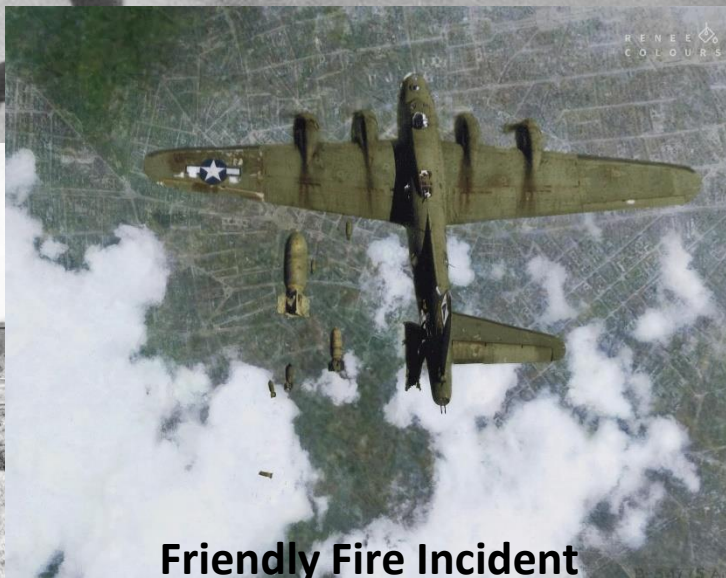
Friendly Fire Incident