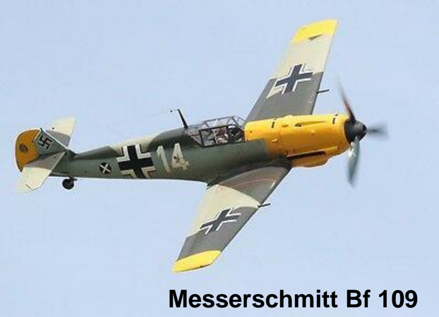
Messerschmitt Bf 109