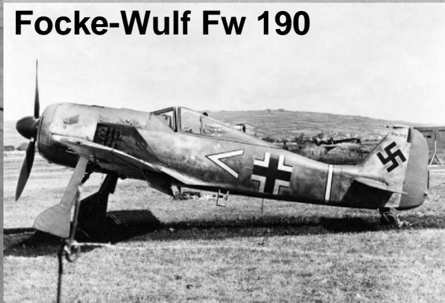
Focke-Wulf Fw 190