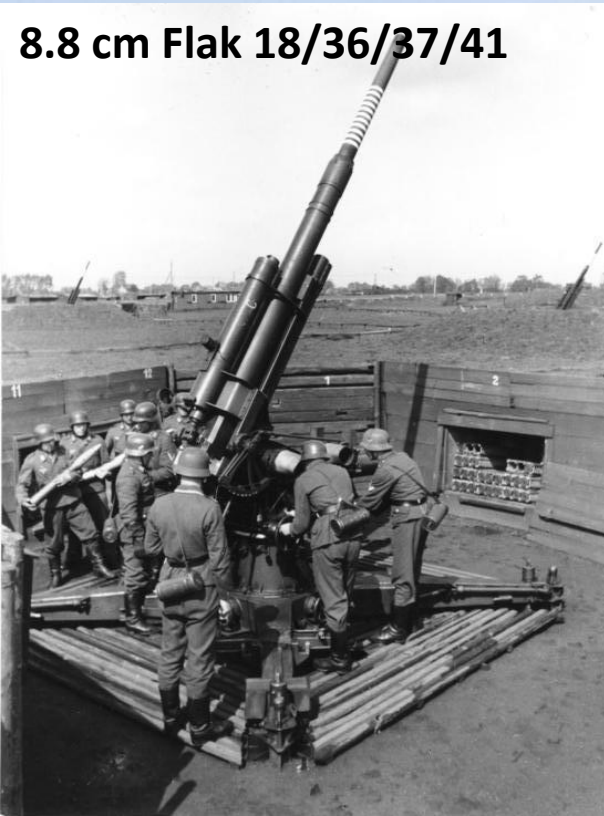
8.8 cm Flak 18/36/37/41