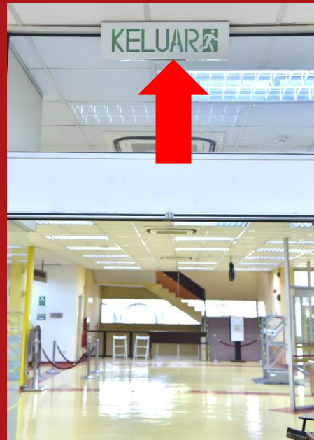
EMERGENCY EXIT SIGNAGE