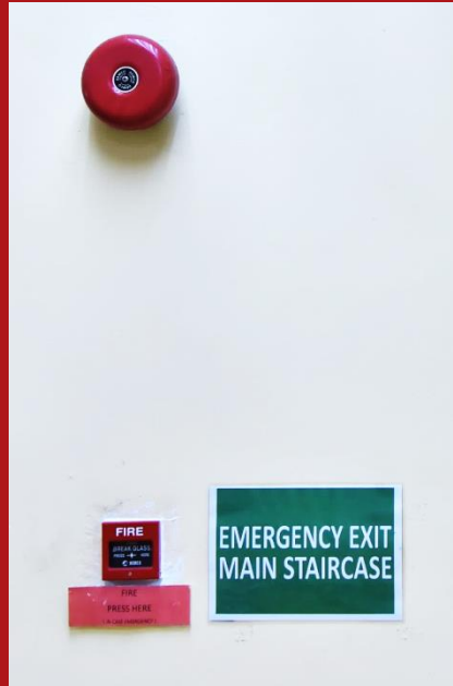
FIRE ALARM BELL