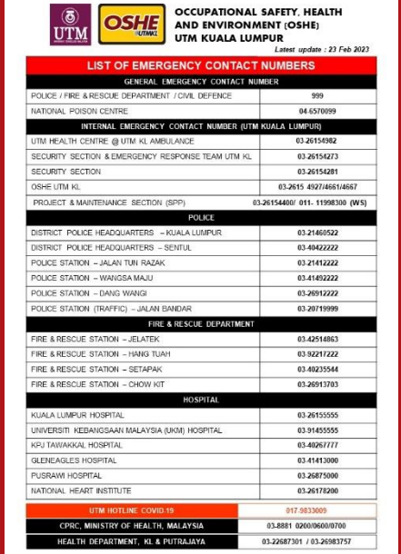
EMERGENCY CONTACT LIST