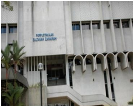
UTM Library KL